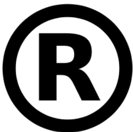
The Trademark Registration Logo