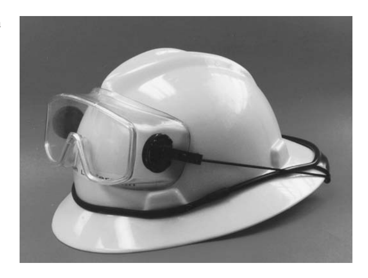
Figure 1-2 Hard hat with safety goggles.