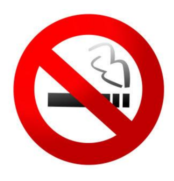
You can't smoke here.