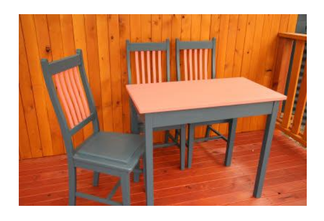
Is there a table? Yes, there is.