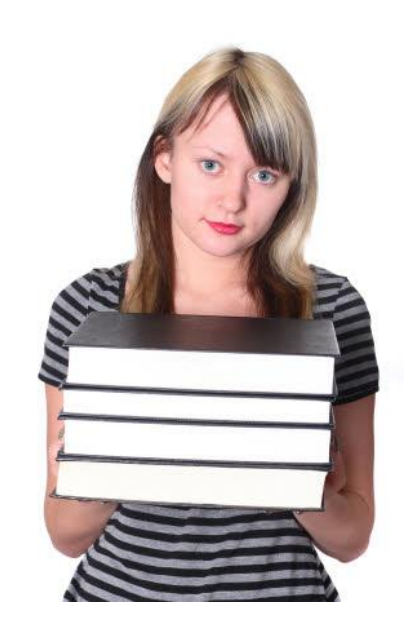
These books are new.