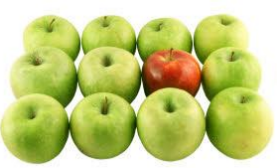
I'm going to eat an apple.