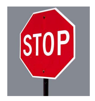
You have to stop here.