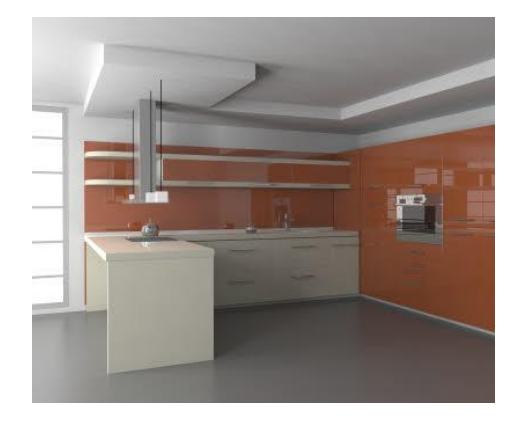
Are there any chairs? No, there aren't.