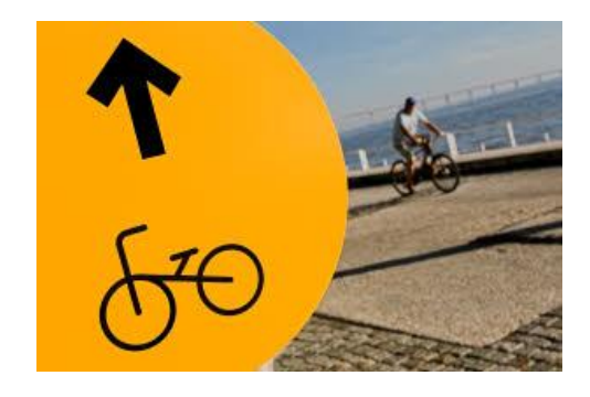
You can ride your bike here.