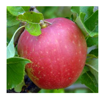
That apple is red.