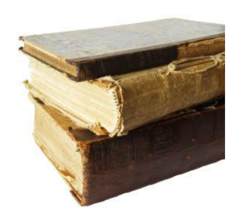
Those books are old.