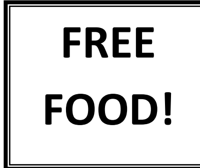
You don't have to pay for the food.