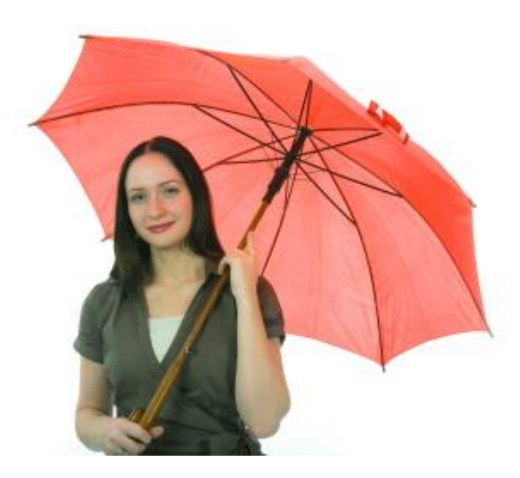
It's going to rain soon.