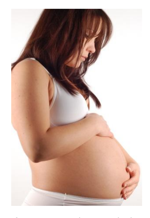
I'm going to have a baby next month.